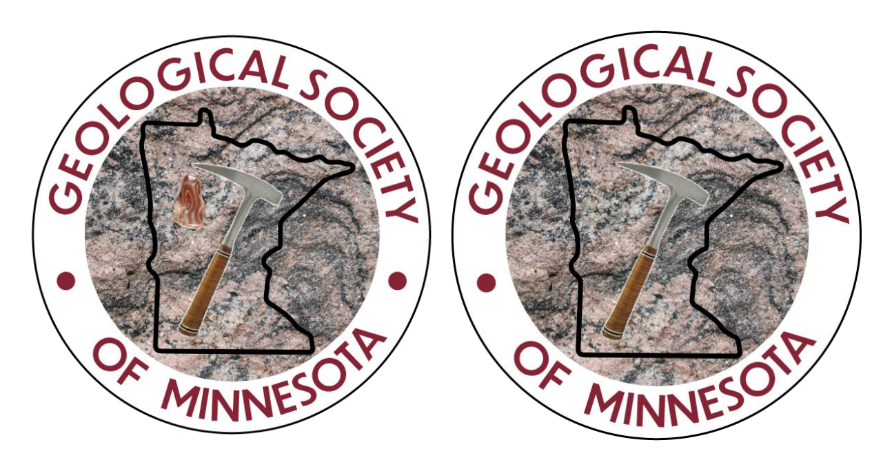
Color: Since we do all of our lectures at the U of MN and have many links to folks at the U I chose to use the U of MN color scheme, yellow on maroon. I got the exact colors for websites.

The next iterations went with the outline of MN on the Morton Gneiss photo to which I had purchased the license. This became the basis for the center.