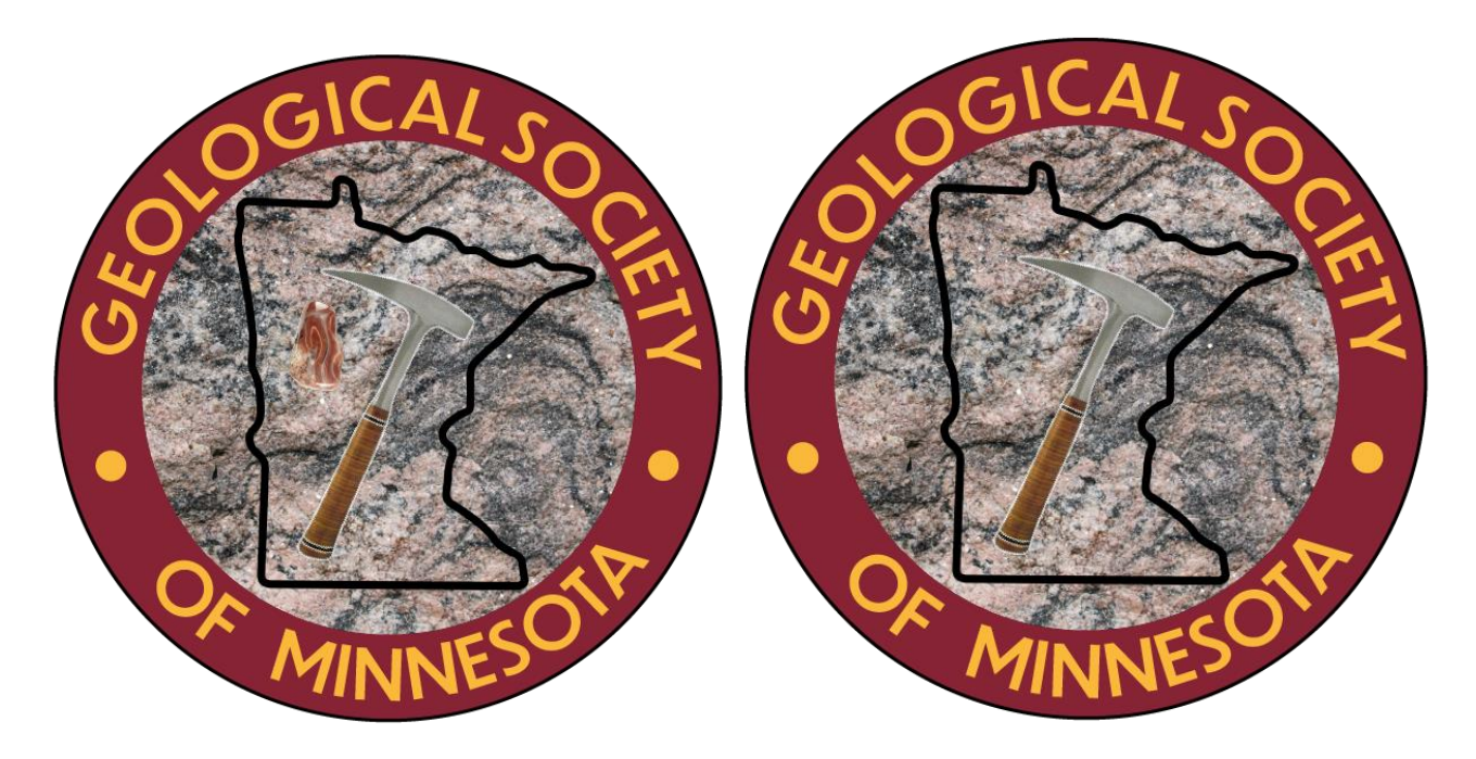
Finally, we added in the GSM start date.